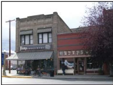
We are here to help!

SHPO staff must approve drafts of publications and interpretive panels prior to production.